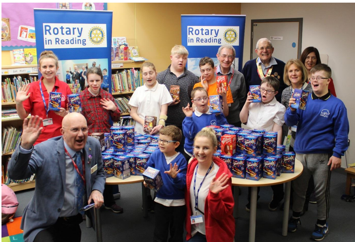
Students display their Easter eggs kindly donated by the Rotary Club of Loddon Vale

Easter has been our RE theme for this half term and Middle school have enjoyed a carousel of activities making Easter crafts and foods and using all their senses to experience Easter. After all the hard work and healthy living everyone deserves a little treat so Happy Easter and enjoy your Easter Eggs and hot cross buns - but not too many! ☺