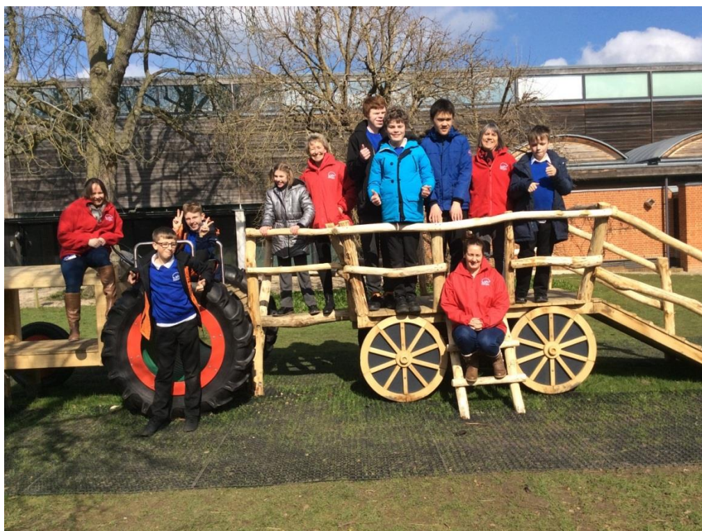
Sycamore class on the Climbing Tractor at Museum of English Rural Life

Sycamore class had a great morning out at the Museum of English Rural Life in Reading learning about how farming has changed over the years with the introduction of new machinery. The pupils enjoyed doing a rat hunt through all of the galleries and some groups managed to find all of the rats. There were interactive games to play in each gallery. A particular favourite game was one in which the pupils had to look after pregnant sheep and keep them safe until they had their lambs. The pupils were all polite and well behaved – a credit to Addington.