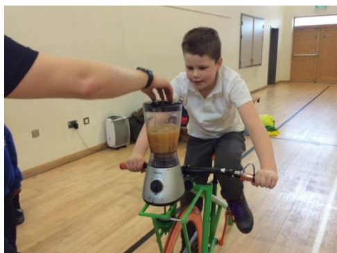
A student uses peddle power to operate the blender and make a smoothie

Middle school Curriculum in the second half of the Spring Term has had a healthy focus. Can you eat chocolate for breakfast? wondered year 3 and 4 classes. The answer is no –not if you want to stay healthy and active. We tried out many fun, fitness activities such as dance, Boxercise and yoga. During healthy Living week we had the opportunity to try many delicious and healthy snacks such as smoothies, wraps and fruit kebabs.